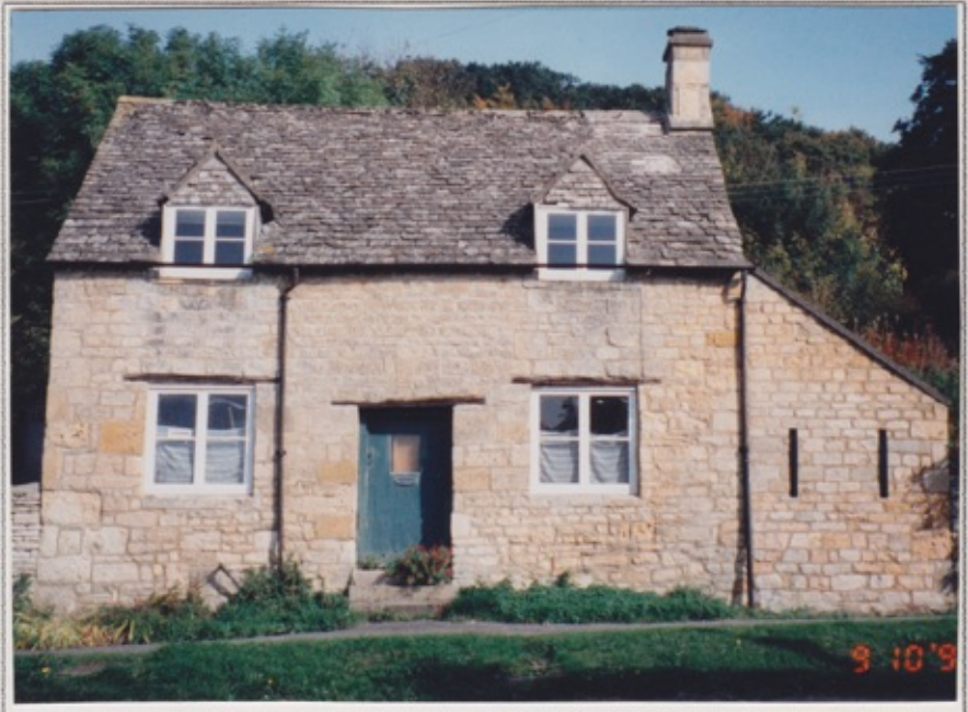
J. "OLD BAKEHOUSE"

The "Old Bakehouse" has dormers resembling those in 'G' above and the chimney looks original, but there may be little else left of the original architecture. Note the inconsistency in the stone-work - in particular the very large stone blocks at the bottom left which do not seem to match the rest of the masonry. And at the right the lean-to with the slit windows is clearly quite recent work, the slits themselves looking strangely unnatural.