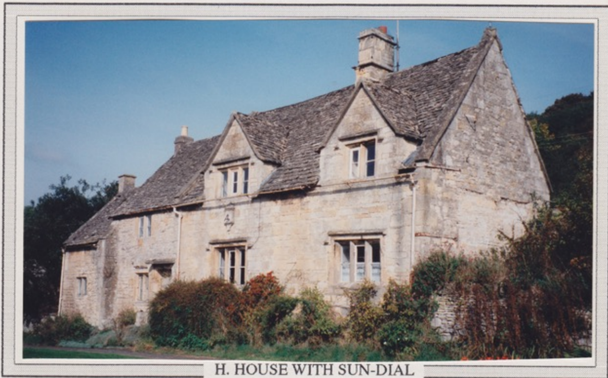
H. HOUSE WITH SUN-DIAL

The "House with Sun-dial" shown below is clearly larger than the cottages just described. The sundial (see next page) provides a date of 1757 which may be the date of construction of the main block (or it may just be the date of the sundial!); perhaps the parts to the left are older? Certainly the main block has features which are reminiscent of the portion of the "Old Rectory" c. 1730. Note also the coping on the end gable, and the signs of alteration to the end wall.