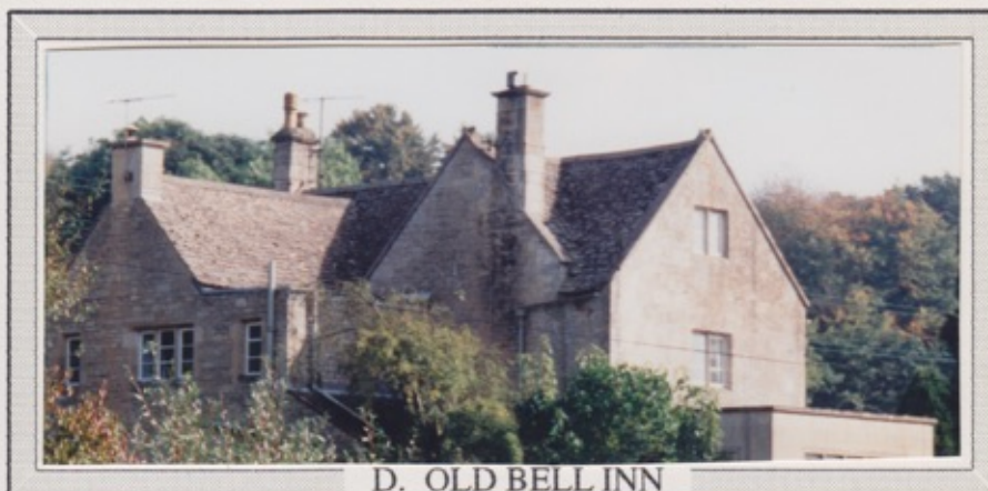
D. OLD BELL INN

Note the large chimney left of centre which appears to emerge from the original block, obstructing or replacing a roof dormer.