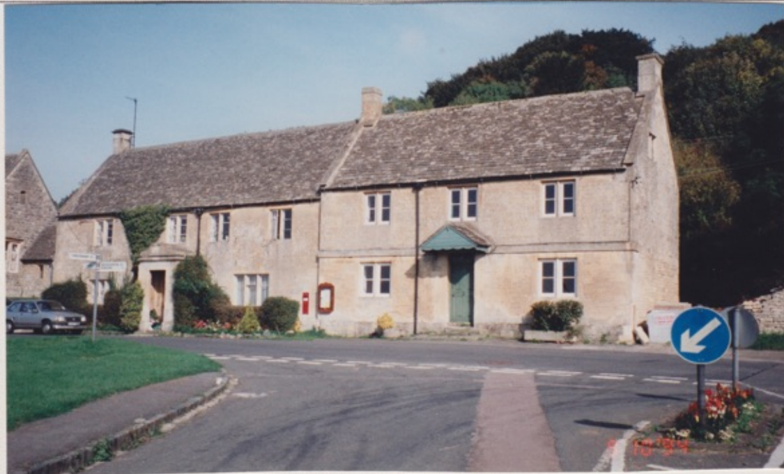
K. HOUSES WITH PORCHES

Two houses with porches (below) stand between the old bakehouse and the village hall. These are perhaps from the late 18th century, and seem relatively unaltered. The imposing stone porch, with its unusual pediment, on the left-hand house is unusual, if slightly incongruous.