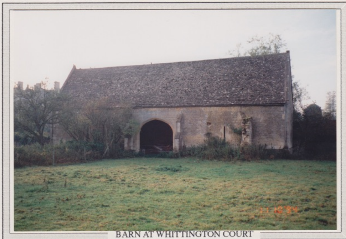
BARN AT WHITTINGTON COURT

Whittington has three fine stone barns, two at Whittington Court, and one in the village. One of the Whittington barns is known to date from 1614. The village barn, shown on the next page, is unusual in being T-shaped, with a substantial rear-ward extension roughly opposite the doorway.