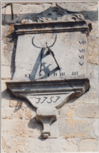
SUN-DIAL ON HOUSE "H"