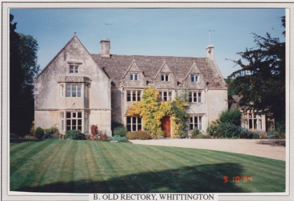
B. OLD RECTORY, WHITTINGTON

The Old Rectory , at first glance, might appear to be an 'echo' of the Court - possibly planned this way in deference to the squire, or perhaps merely following the local style of the period. The frontage of the Rectory, like that of the Court, is built of ashlar stone (unlike the more modest cottages in the village), and this is consistent with the early 18th century, when major alterations were carried out (see below). The house is set off by a lovely and beautifully maintained garden - thanks to its present owners. They told us that the main part of the house (to the right) dates from the 16th century, the gabled wing to the left being an 18th century addition. The following discussion adds a little more based on documentary evidence, and our own observations.