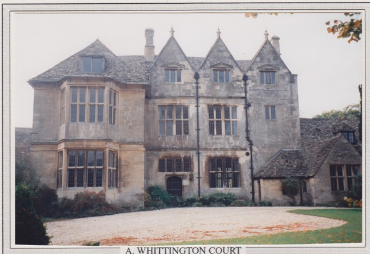
A. WHITTINGTON COURT

The three large houses are: Whittington Court; The Old Rectory; Sandywell Park. The first two, whose oldest parts date from the 16th century, are superficially similar, though there are many differences in detail; the third, dating from the early 18th century is very different.