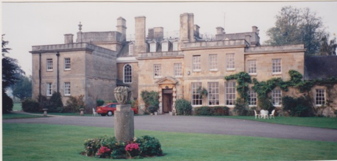
C. SANDYWELL PARK - EAST SIDE

Sandywell Park is described by Pevsner and in "Country Houses of Gloucestershire" and dates from the beginning of the 18th century (earlier than the rebuilding of the rectory). It sharply contrasts with the medieval architecture of the preceding houses; we are no longer seeing the "vernacular" architecture of Gloucestershire, the work clearly being that of an architect - bringing "polite" architecture to these parts at a time when the traditional architecture was being retained for the other local houses- and would be for another 150 years.