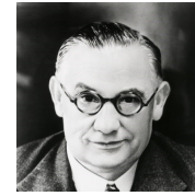
B Ernest Bevin ..